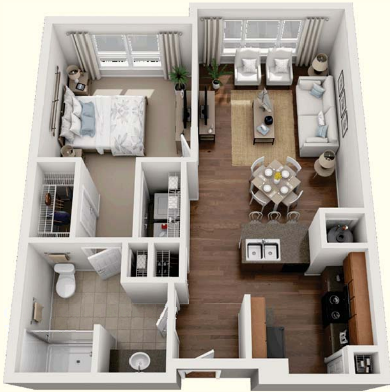
Deleni One Bedroom / One Bath 728 Sq. Ft.*