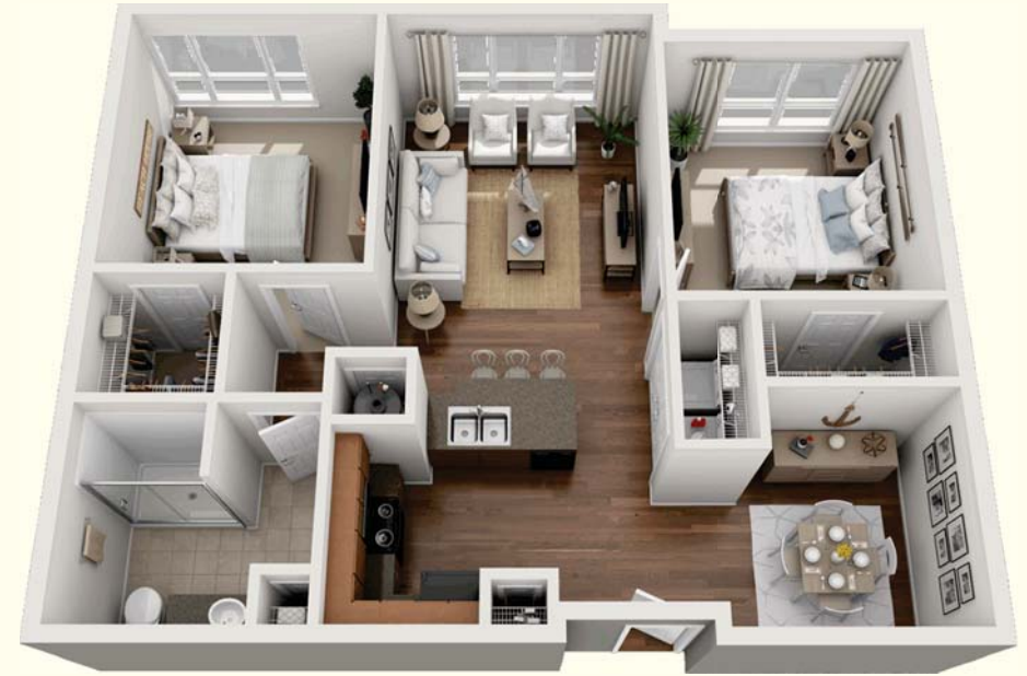
Suva Two Bedroom / One Bath 971 Sq. Ft.*